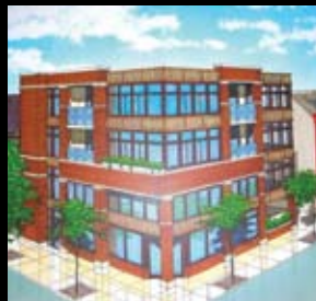
801 - 805 N. 2ND STREET