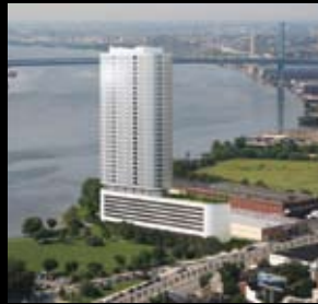
1143 N. DELAWARE AVENUE