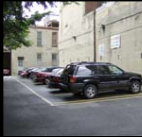
28 N. 3RD STREET - REAR