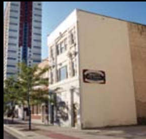
24 S. NORTH CAROLINA AVENUE