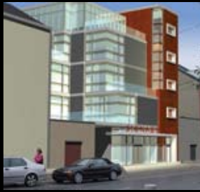
950 - 954 N. 2ND STREET