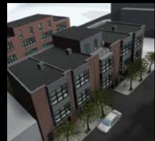
613 - 625 N. 3RD STREET