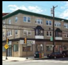
632 - 634 N. 2ND STREET