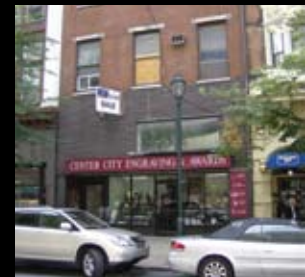
1206 WALNUT STREET