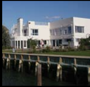
3305 AMHERST AVENUE