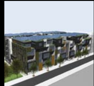
1115 - 1125 N. BODINE STREET