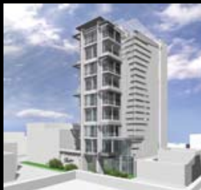
614 - 620 N. AMERICAN STREET