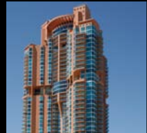
PORTOFINO CONDO UNIT 2606