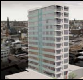
622 - 626 N. 2ND STREET