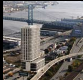
412 - 438 NORTH FRONT STREET

Prime Site adjacent to the Historic Penn Treaty Park and the Sugar House Casino site.