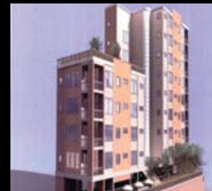
933 - 937 N. FRONT STREET