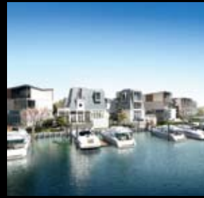
AQUELLA SNUG HARBOR