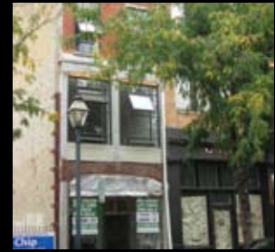
239 MARKET STREET - 2ND FLOOR