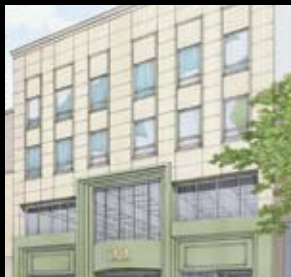
1210 - 1212 CHESTNUT STREET