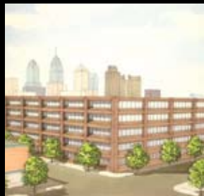
626 - 636 N. 5TH STREET