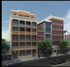
241 - 245 MARKET STREET