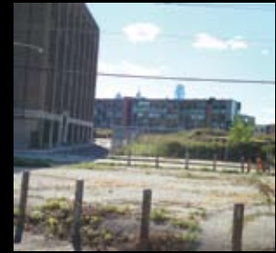
1102 - 1121 N. HOWARD STREET