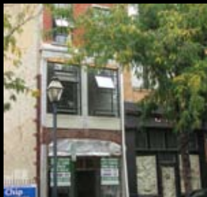
239 MARKET STREET - 1ST FLOOR