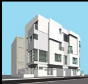
223 GREEN STREET