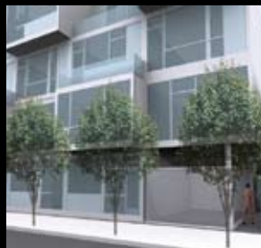
836 - 850 N. 3RD STREET