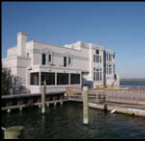
447 N. THURLOW AVENUE