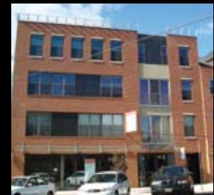
712 N. 2ND STREET - UNIT 21