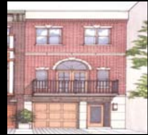
947 NEW MARKET STREET