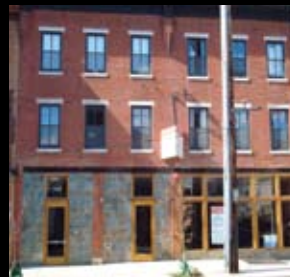
722 N. 2ND STREET - UNIT 301