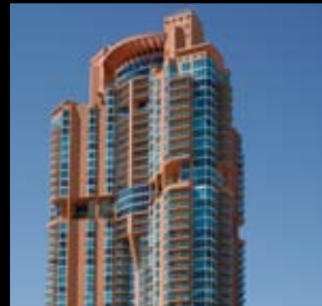
PORTOFINO CONDO UNIT 603