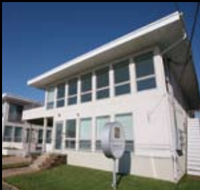
3215 ATLANTIC AVENUE C-1