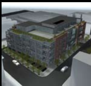
600 N. 3RD STREET