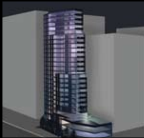
500 - 506 WALNUT STREET