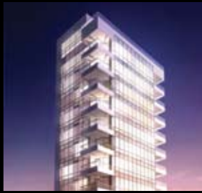
101 WALNUT - 2ND FLOOR