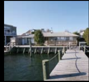
445 N. THURLOW AVENUE