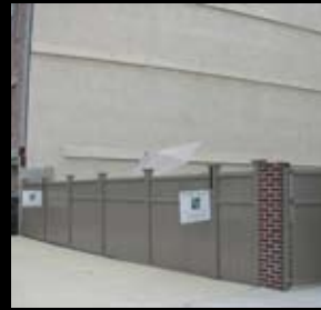
808 - 810 S. SWANSON STREET